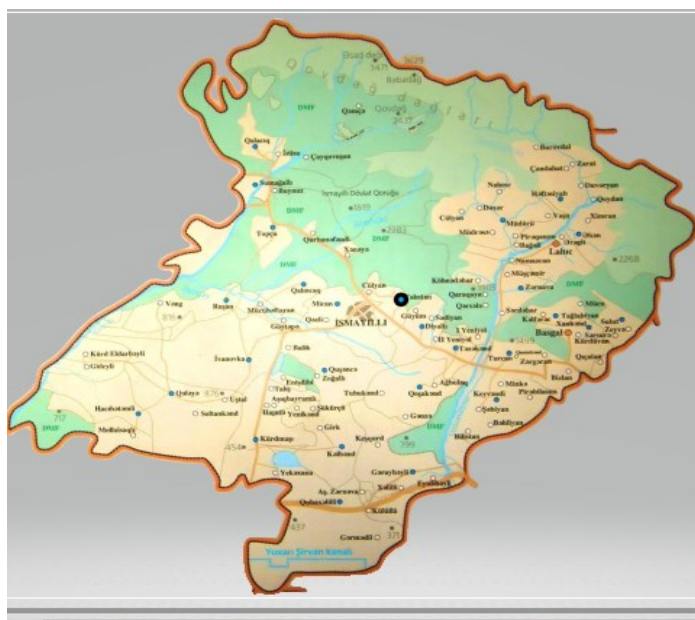
Figure. 1. Farms located in Talistan village, Ismayilli district

During the study, 1-2 samples of feces from calves with clinically observed signs of diarrhea were used, collected from calves located in the following farms - 5 farms in the village of Talistan, Ismayilli region, 5 farms in the villages of Nohur-Kishlyk and Vandan, Gabala region, 10 farms in the villages of Yeni Suvagil, Kurdamir, Aliabad and Mukha, Zagatala region. The experiment was carried out on 45 calves in 20 farms during the period July-October 2023. Of the 45 calves, 28 heads of calves are local breed calves, 11 heads of calves are a cross between Simmental and local breed calves, 3 heads of calves are a cross between Angus and local breed calves, 3 heads of calves are a cross between Swiss and local breed calves. Farms were selected on the basis of having 10-50 dairy cows. For clinical signs, factors such as animal manure moisture, its color, frequency of excretion and organoleptic characteristics of the animal manure contents were taken into account.