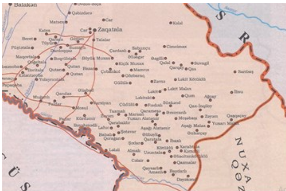
Figure 2. Zagatala region: location of farms in the villages of Yeni Suvagil, Kurdamir, Aliabad, Mukhakh.