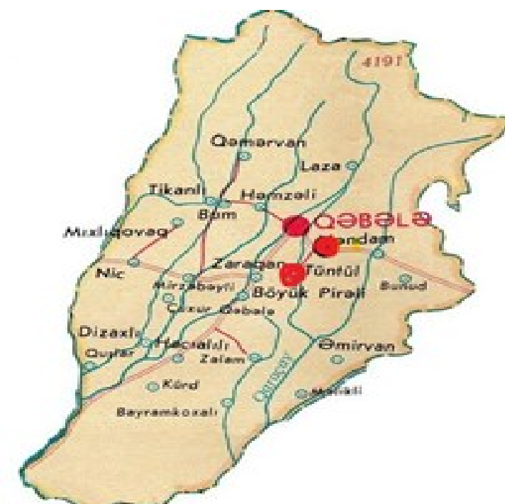
Figure 3. Farms located in Gabala district, Nohur Kishlaq and Vandam villages.