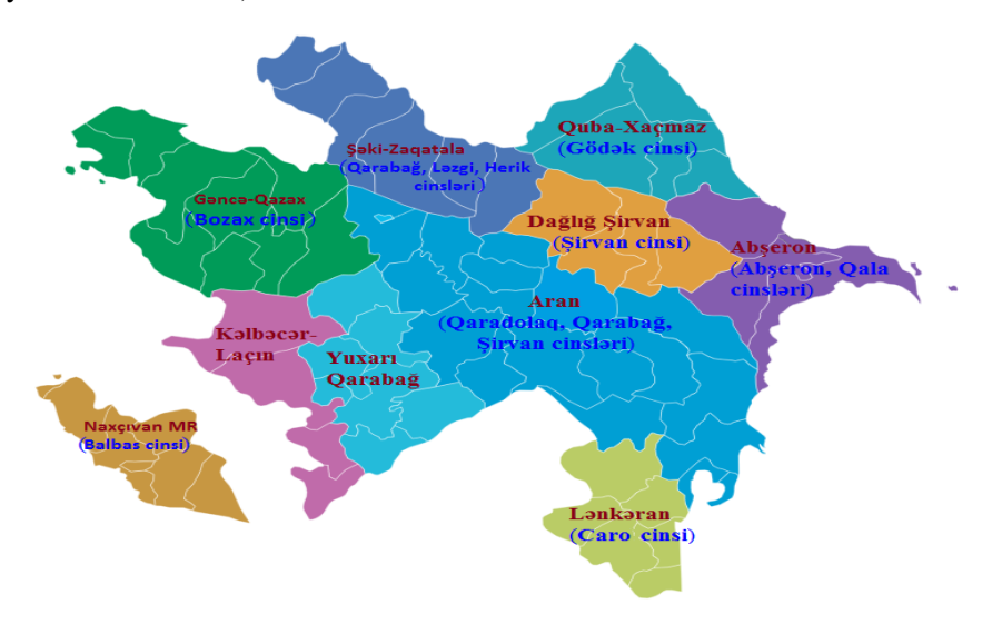
Figure 1. Map in Azerbaijan Republic

Specific characteristics of local sheep breeds should be analyzed and taken into account during regionalization in order to ensure and regulate continuous, sustainable and rational development of sheep breeding in the Republic. The very unique properties of many sheep breeds and their adaptive abilities should be studied (genetic resistance to diseases, adaptation to abrupt climate change, high lambing, etc.) (Golikov, 1985). Strict control over the genetic biodiversity of sheep and the establishment of an appropriate system for its management give a very big guarantee for global food security, as well as for satisfaction of needs of the population for food and other raw materials (hides, leather, wool, yeanling, etc.) (Veniaminov & Sergeev, 1979; Veniaminov, 1981). Therefore, the regionalization of sheep breeds should be carried out correctly in accordance with the biological and economic characteristics. Thus, rearing of Balbas breeds in Nakhchivan AR, of Bozakh breeds in Ganja and Gazakh regions, Azerbaijan Mountain Merino in Gadabay and Shamkir regions, Absheron and Gala breeds in Absheron peninsula, Garadolak breed in Agjabadi region, Jaro breed in Lankaran region, Absheron, Godek breeds in Guba-Khachmaz regions, Karabakh, Lezgi and Herik breeds in Sheki-Zagatala and Shirvan breed in Kur-Araz regions would be much more reasonable (Erokhin et al., 1999; Zhiryakov et al., 2002).