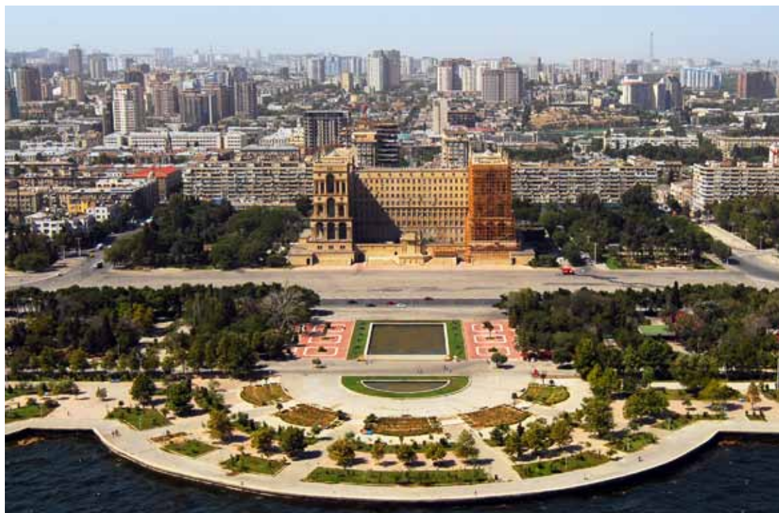
Today's Azerbaijan is a modern republic grappling with how best to develop its economy in an equitable way while making the most of its vast oil and gas reserves.