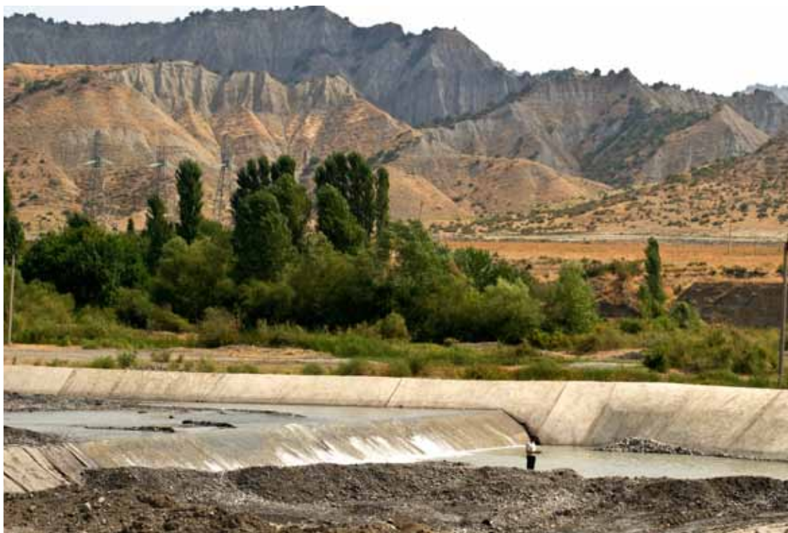
ADB's operations in Azerbaijan support the government's priority areas of water supply and sanitation, energy, and transport.

developed and rehabilitated. Failure to protect watersheds has worsened flooding, and the heavy sediment load of floodwaters has diminished agricultural productivity.