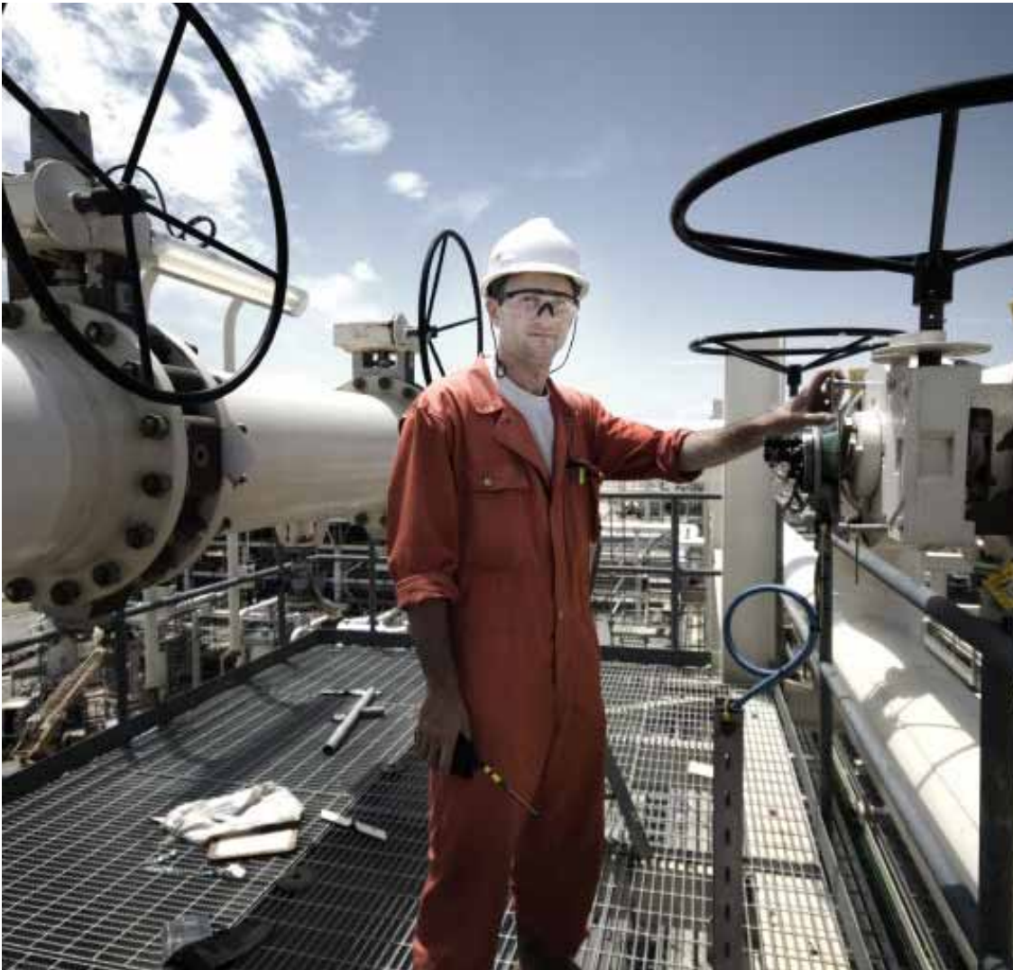
Azerbaijan's development efforts are bolstered by a strong, although narrowly based economy. The oil sector accounts for about 55% of gross domestic product.

development by exposing the country to best practices in social safeguards, procurement, and project implementation.