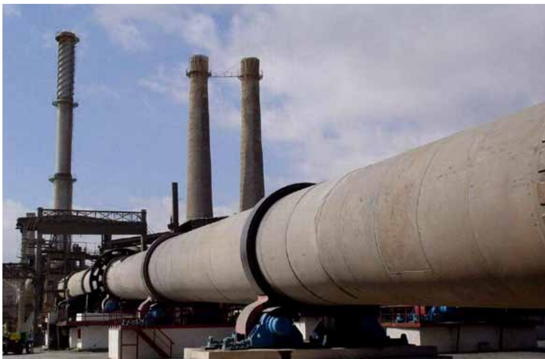
High-quality, locally made cement will help the government and the private sector complete the infrastructure needed to boost regional trade and tourism and diversify the country's sources of economic growth beyond the oil and gas sector—a key government priority.

trade transactions. The program was created because companies in developing member countries, particularly smaller firms, typically find it difficult to access trade finance.