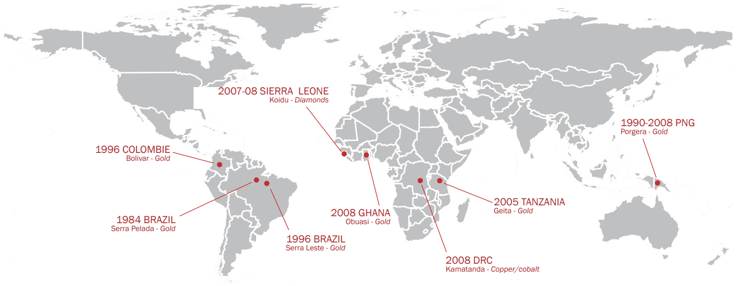
Map 1. Sample of clashes reportedly caused by ASM - LSM interaction