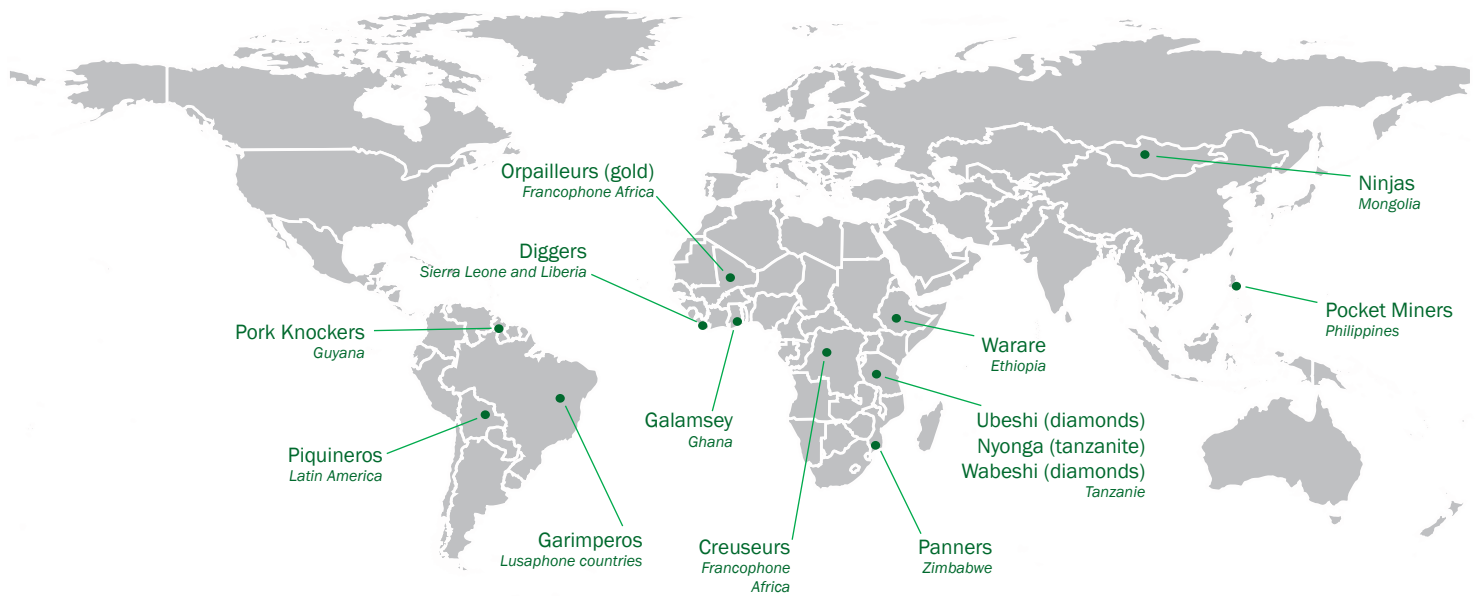
Map 2. Colloquial names for artisanal miners